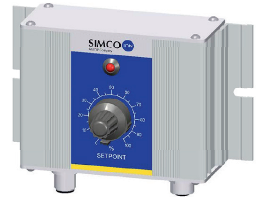
External control unit optional